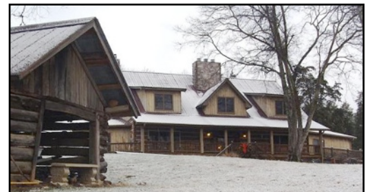
Narrow Gate's main lodge in Williamsport, TN

Narrow Gate has a school of ministry connected to them and students will continue through the KI Bronze-level classes during their stay. We also hope to add an apologetics course that will be taught by two of our brothers from Narrow Gate sometime in 2010 – stay tuned!