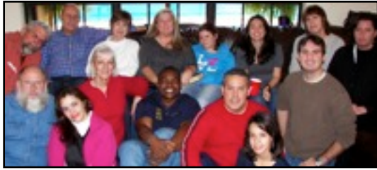
KI'ers fellowship in Florida!