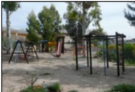
"They call it the 'museum'. Every single piece of equipment is useless, unsafe. It needs to be replaced."