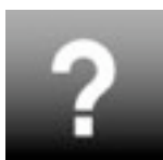
Special Mystery Guest