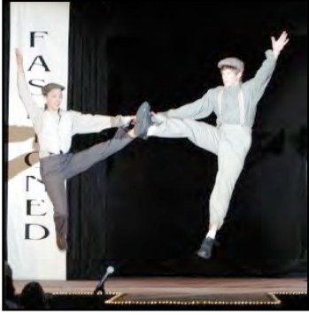
Fashion Forward Ministries