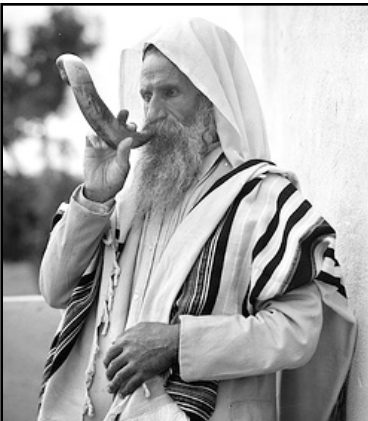
Blowing the Shofar